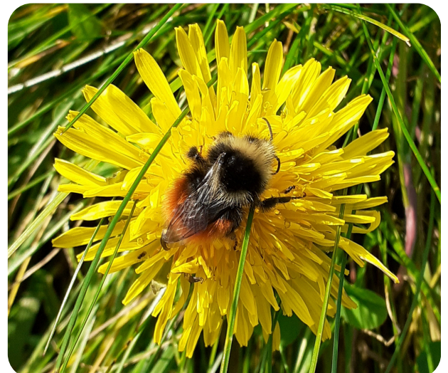
Blaeberry Bumblebee