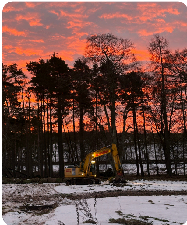
Castle Fraser Pond Work

A project led by the North East Ranger Service is now underway to increase habitat opportunities at Castle Fraser, Garden, and Estate for the northern damselfly ( Coenagrion hastulatum ) thanks to funds made possible through People's Postcode Lottery. This rare, Scottish species is one of NESBiP's Big 5 as well as one of the National Trust for Scotland's priority species as laid out in the charity's Plan for Nature. Beginning on 12 th January 2026, machinery arrived on site at Castle Fraser to begin works to excavate a new pond designed in collaboration with the British Dragonfly Society. When the project is complete, we hope this pond will support the estate's already established population of northern damselflies continue to thrive and begin to expand their range. We look forward to bringing more updates as the project unfolds and presenting more details at the upcoming Spring Seminar in March.