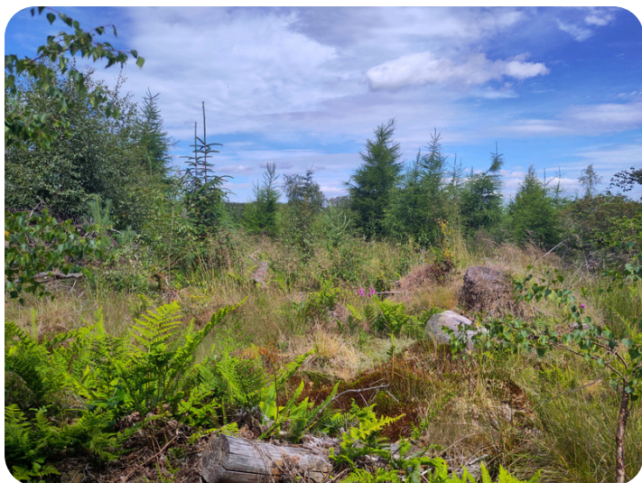
View of regenerating woodland at Drum

Both blocks of new land were previously used for forestry operations and contained mostly Scots pine, Norway and Sitka spruce. Included in this parcel is the historic drive for the Castle and the landscape feature Robbie Rossie's loch. Having the opportunity to expand the wood pasture habitat across the new land will support all the species which currently live in the Old Wood and will provide new ways for people to spend time in and connect with this special place.