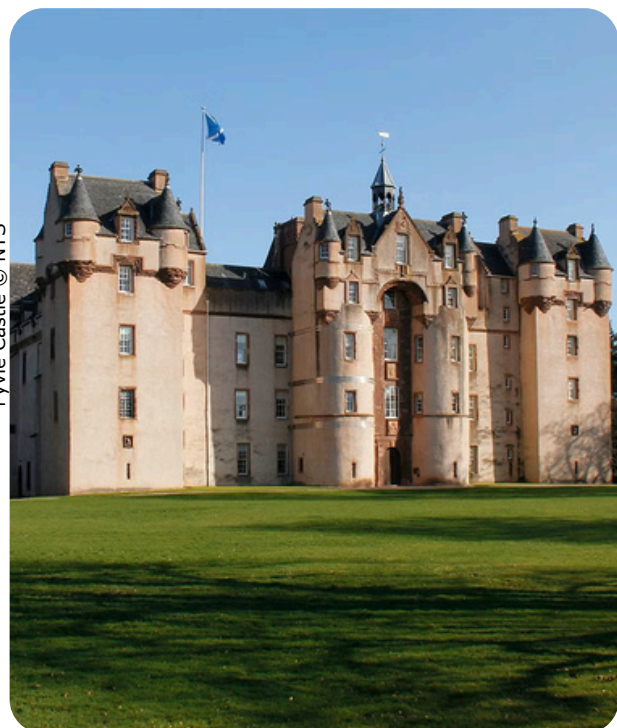
Fyvie Castle