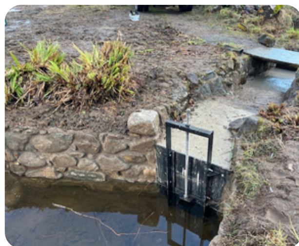
Leith Hall Outflow and Sluice

The work at the pond follows forestry restructuring as we move from exotic conifer plantations to more nature-friendly native pine and broadleaf mixes and maximising the wetter areas we have for nature.