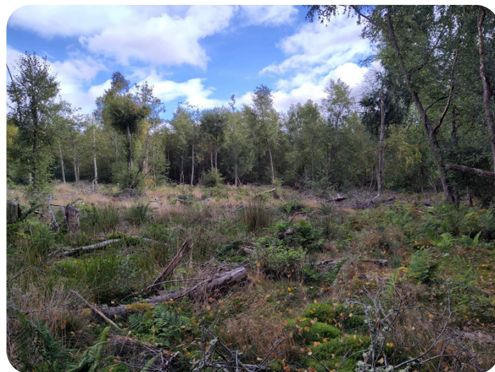
Drum clear-felled area